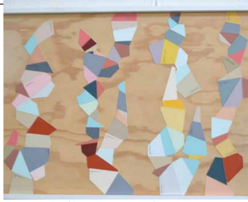
'Arctic Whispers' paper on wood 60 x 40 cm 2014

The Stalacmites are a playful exploration of colour using paint swatches and pine ply. A garden of colour abstraction climbs up the walls, the text acting as a poetical narrative for these forms. Taking found objects from our everyday and reinventing them into a new way of looking at the overlooked is hopefully as entertaining as it is beautiful. Stalacmites are where tall stories can grow.