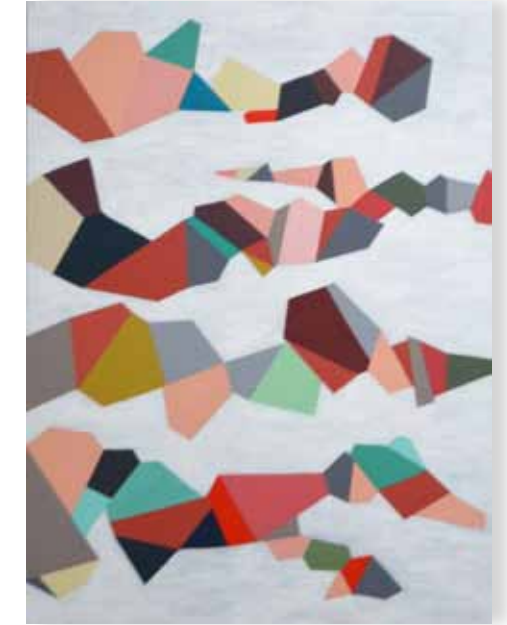
'Kaleidescape' acrylic on canvas 91 x 122 cm 2015