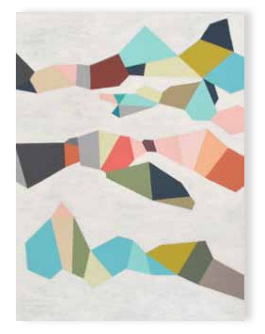
'Slip Stream' acrylic on canvas 91 x 122 cm 2015